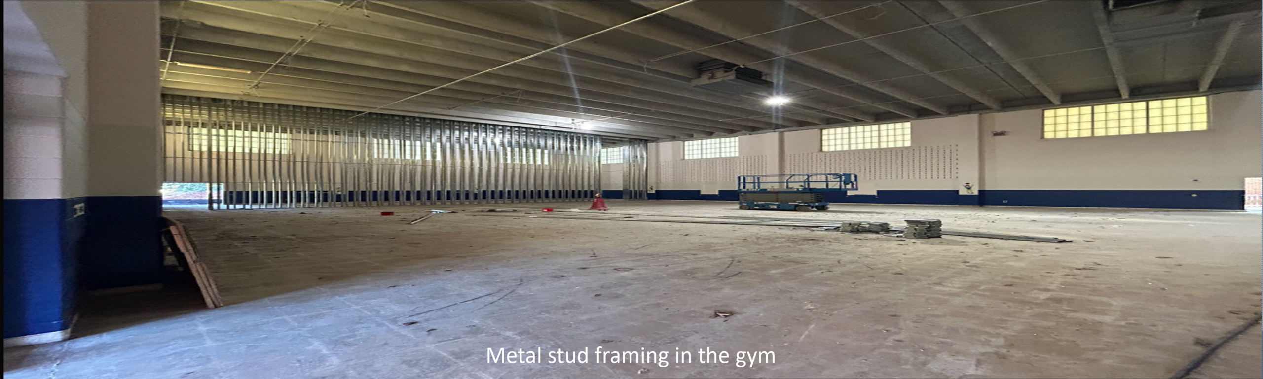
Metal stud framing in the gym