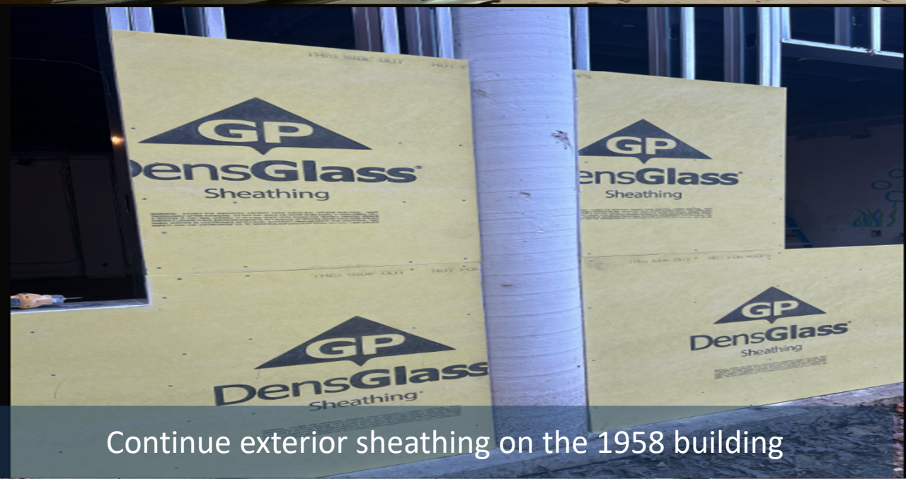
Continue exterior sheathing on the 1958 building