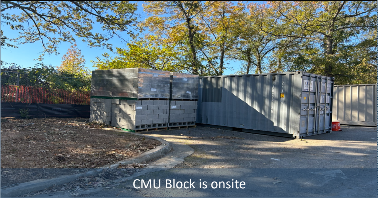
CMU Block is onsite