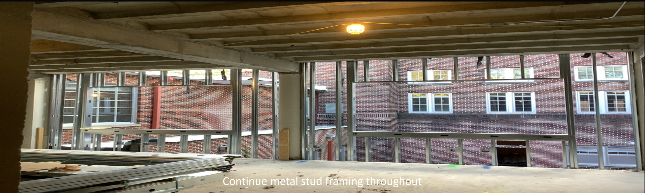
Continue metal stud framing throughout