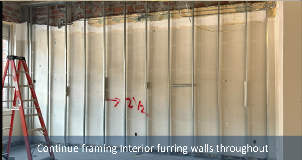
Continue framing Interior furring walls throughout