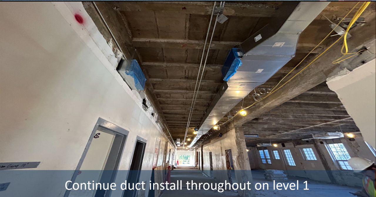
Continue duct install throughout on level 1